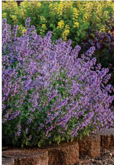
'Cat's Meow' Nepeta faassenii

Tidy, dense habit that keeps its shape all season long.