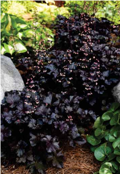
PRIMO® 'Black Pearl' Heuchera

Extremely vigorous and rugged - even in full sun! Very intense black color.