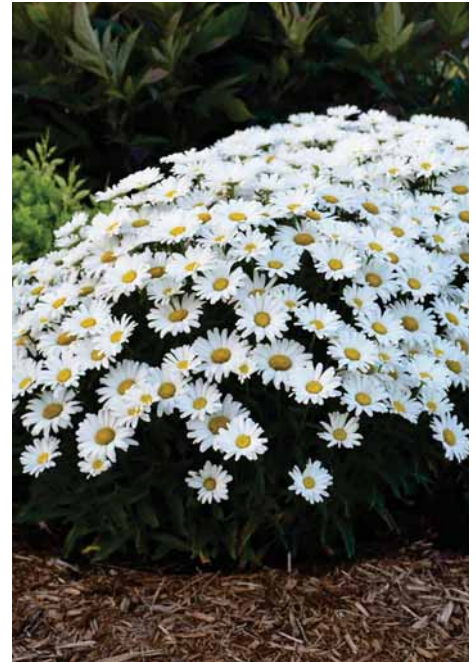
AMAZING DAISIES® DAISY MAY® Leucanthemum superbum

H: 17-20" / W: 24-36" / Z: 3-8 / E: Full Sun